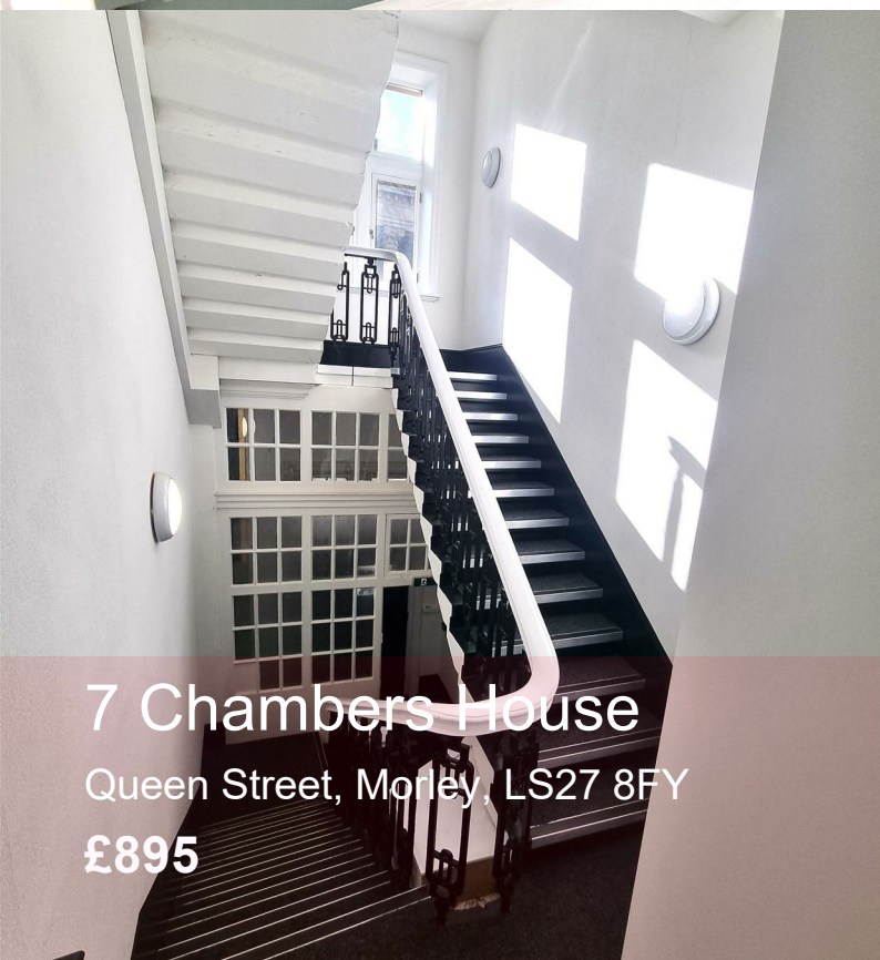
7 Chambers House Queen Street, Morley, LS27 8FY £895